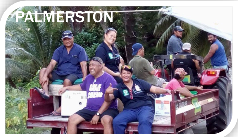
NORTHERN GROUP OUTREACH TEAM 2017 with the crew of Te Kukupa – Police Patrol Boat