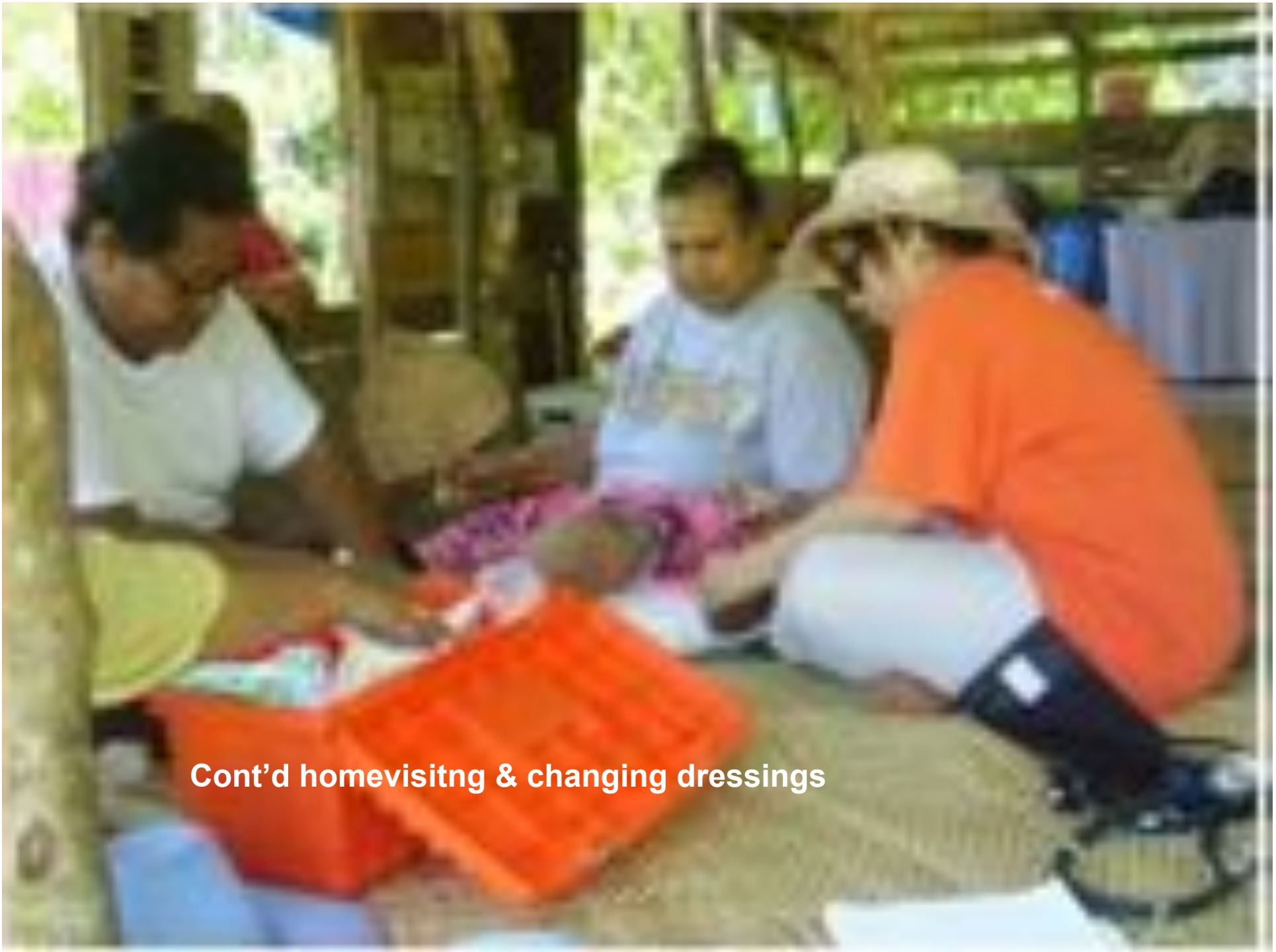
Cont'd homevisitng & changing dressings