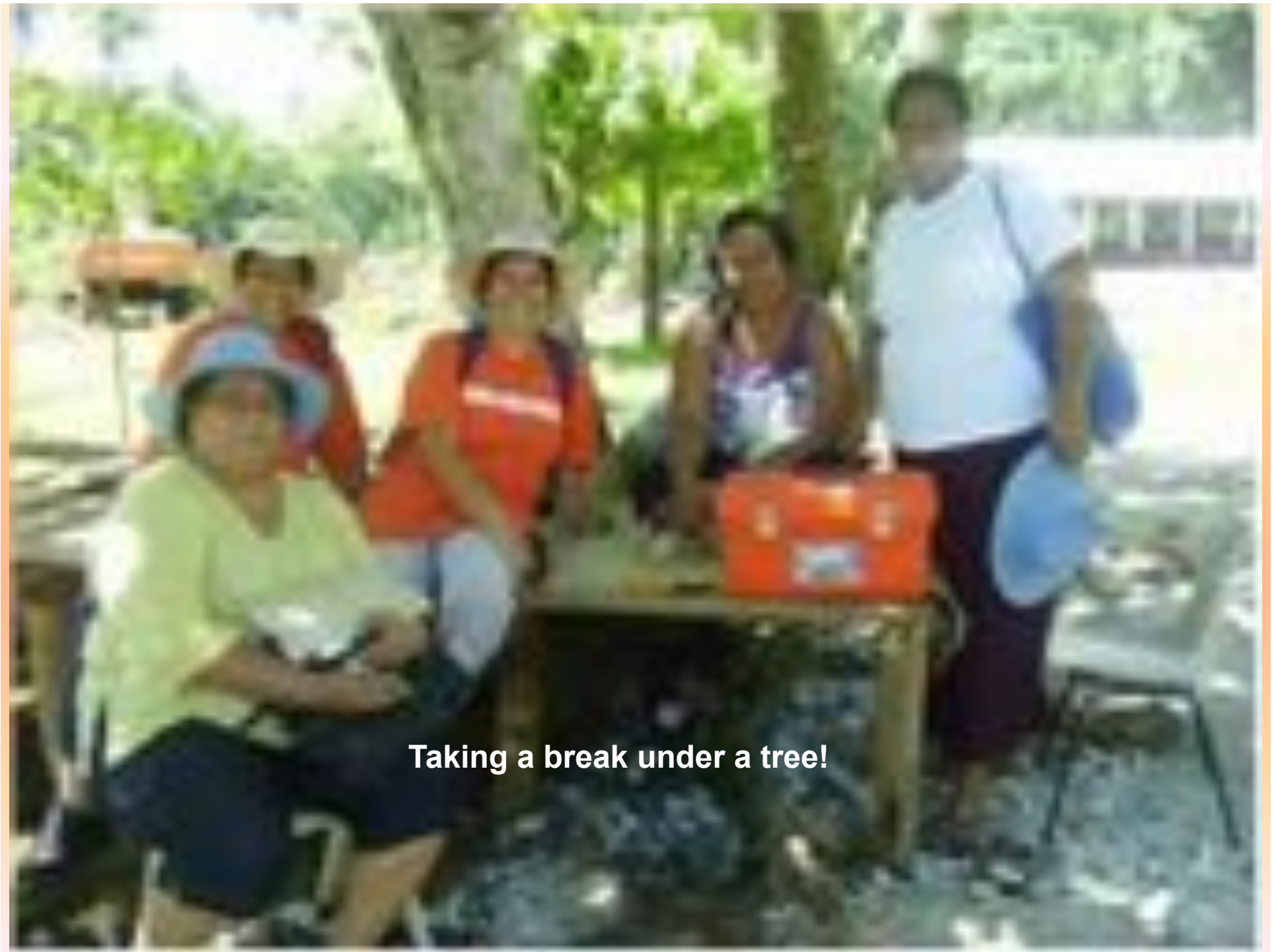
Taking a break under a tree!