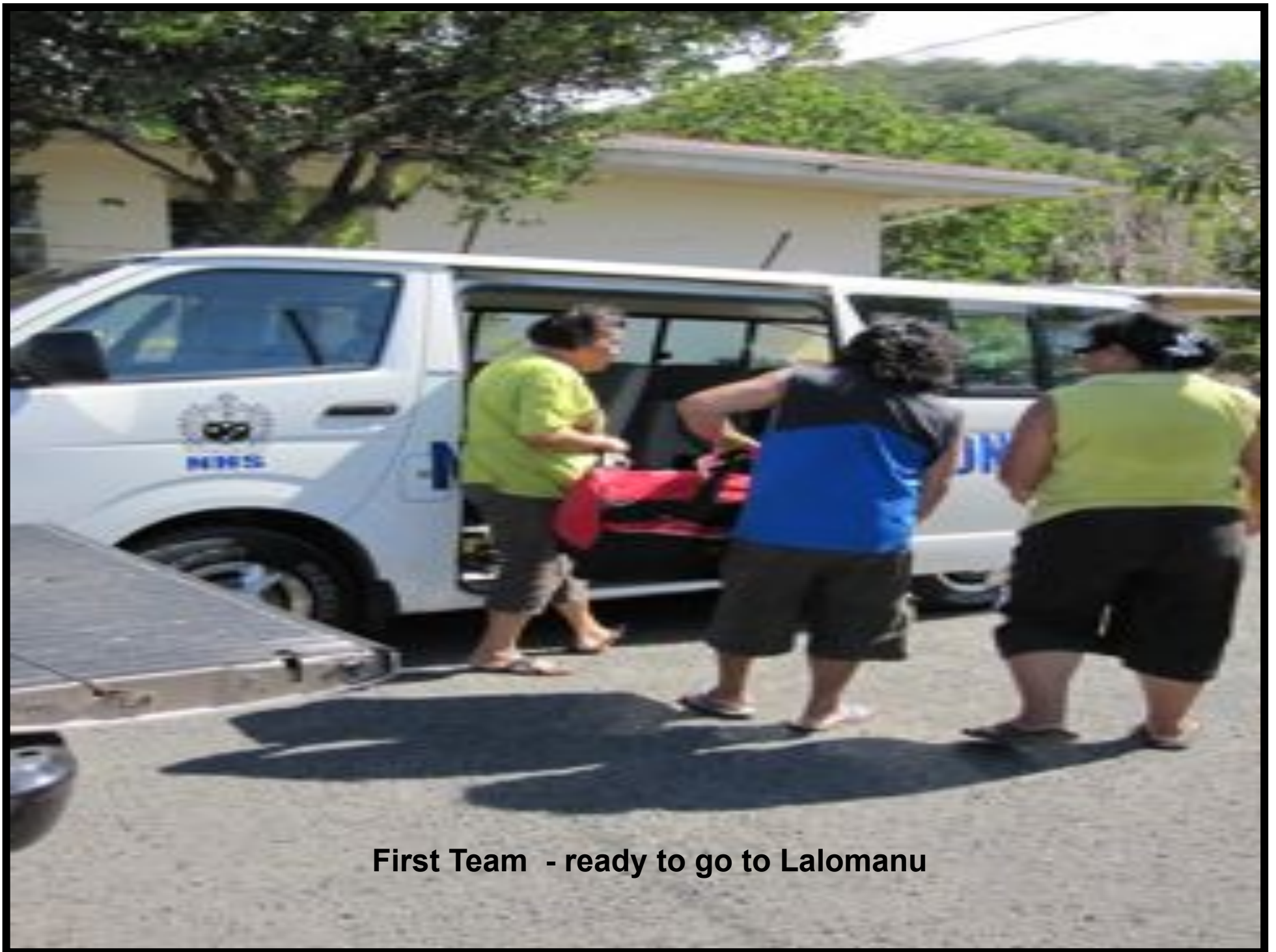
First Team - ready to go to Lalomanu