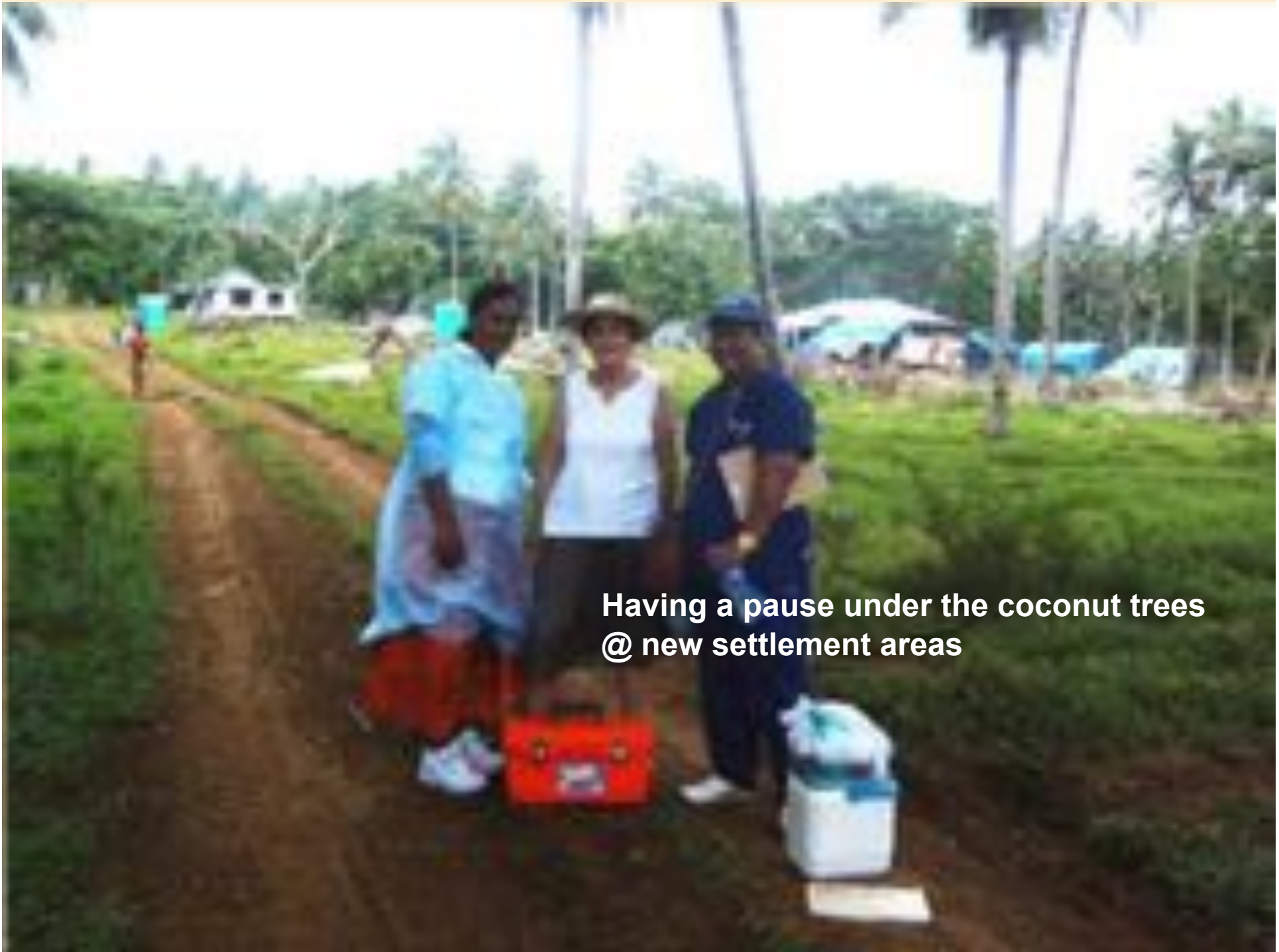
Having a pause under the coconut trees @ new settlement areas