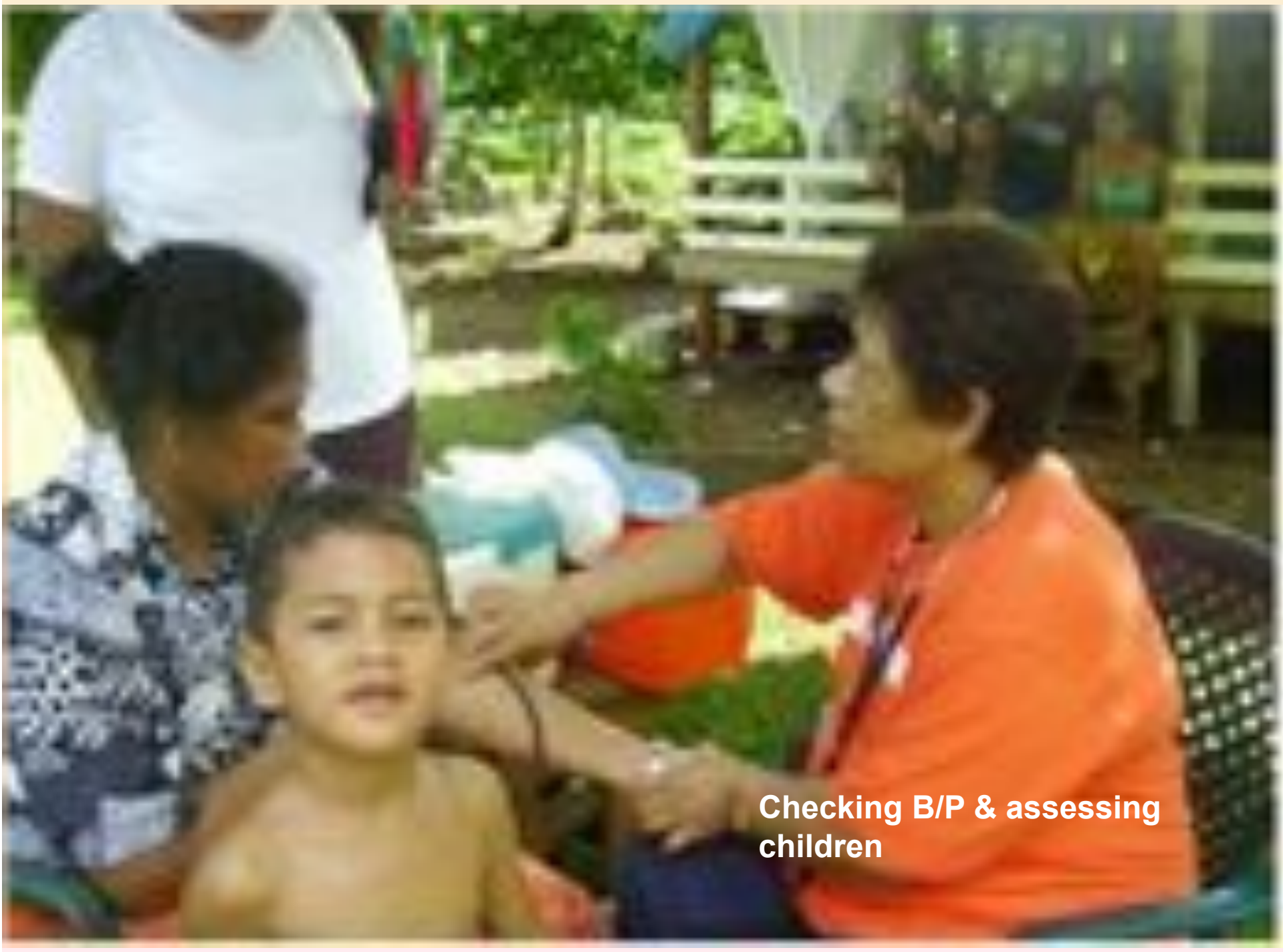
Checking B/P & assessing children